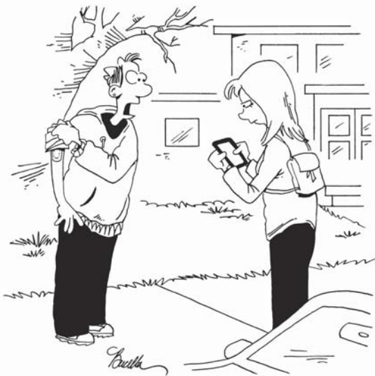
“I used to text, but now there’s a patch that allows me to communicate face to face.”

“Publication of paid advertisements in the Association’s newsletter is not an endorsement or recommendation of any advertised product or service. The Association is not responsible nor liable for the content of any advertisement published, here.”