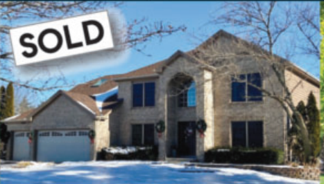
23628 Deer Chase Ln., Naperville - $505,000