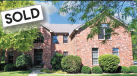
4503 Pipestone Ct., Naperville - $595,000