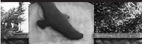
Clow Creek Farm