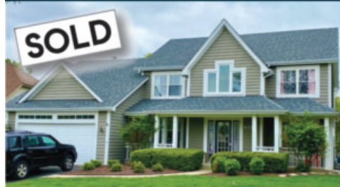
4511 Pipestone Ct., Naperville - $521,000

Whether you are looking to... Buy - Sell - Invest - Rent ...we are your one complete source.