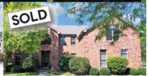
4503 Pipestone Ct., Naperville - $595,000