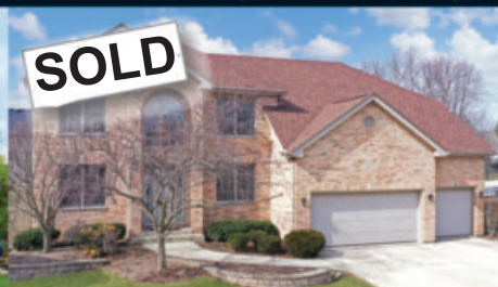
4515 Pipestone Ct., Naperville - $642,000