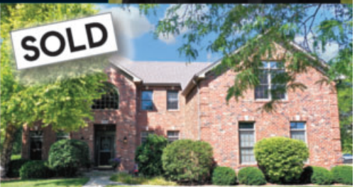
4503 Pipestone Ct., Naperville - $595,000