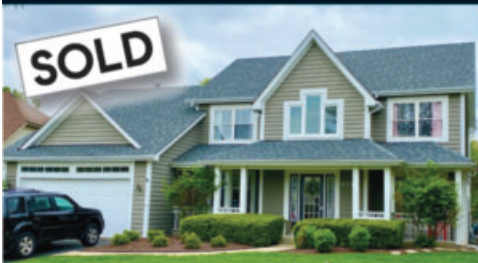
4511 Pipestone Ct., Naperville - $521,000

Whether you are looking to... Buy - Sell - Invest - Rent ...we are your one complete source.