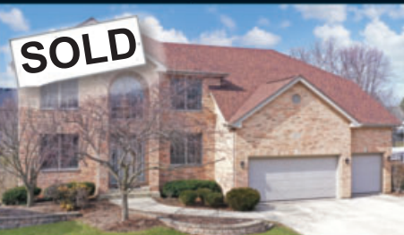
4515 Pipestone Ct., Naperville - $642,000