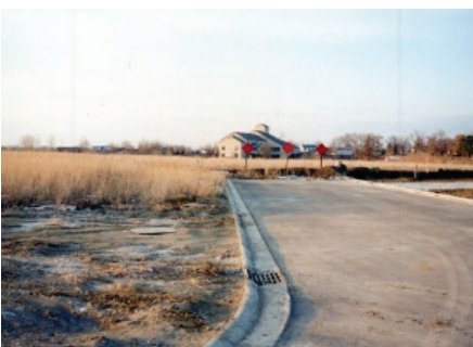
Photo 4 – From the DeCarlo homestead, looking east towards Book Road and 104th. Patterson Elementary is in the background. Look for a future story in our newsletter regarding this photo.

Photo 3 – The DeCarlo homestead on Haider looking east across Alfalfa Lane and towards Book Road and River Run.