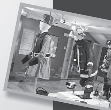
EXHIBIT A Strong Back and A Strong Mind

150 Years of the Naperville Fire Department