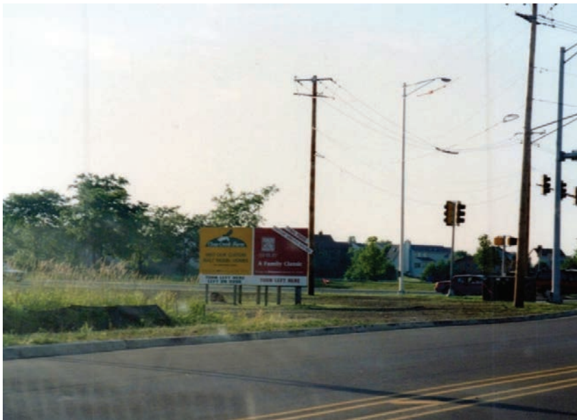
Photo 1 (left) shows the billboard at Naper-Plainfield Road and 95th directing future CCF homeowners to our enclave.